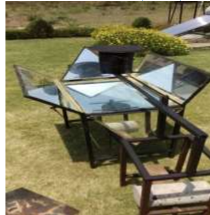
Figure:-2 Image of Four Reflectors are working

The test was led at LNCT COLLEGE OF ENGINEERING AND TECHNOLOGY, Bhopal (Madhya Pradesh) India on march and april 2019. The gatherer was looked toward the sun and changed its situations with time or the situation of sun. Be that as it may, the framework was trying in a few times in the day and the gatherer was changed its situation with the situation of the sun in multi day.