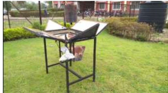
Fig:-2 Image of arrangement of flat plat solar collector housing Hexagonal reflector.

The test was directed to think about the presentation of the sun based warm gatherer with the reflector. A sun oriented vitality authority is utilized to gather direct brilliant vitality having parallel ways and diffused brilliant vitality from sun. The most extreme groupings of sun powered vitality gatherers gather diffuse and direct sun based radiation. A reflector concentrates direct radiation onto a first or mobile gatherer and mirrors a significant bit of the diffused radiation onto the Flat plate authority position close to a focal point of reflector. The Flat plate gatherer was situated so that it gets both the immediate and diffused radiation during the day time.